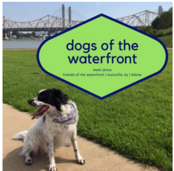
Dogs of the Waterfront: Meet Jenna